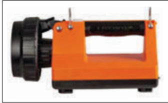
Handle clearance accommodates heavy gloves, making hand-offs easier