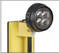
Head rotates to aim the beam